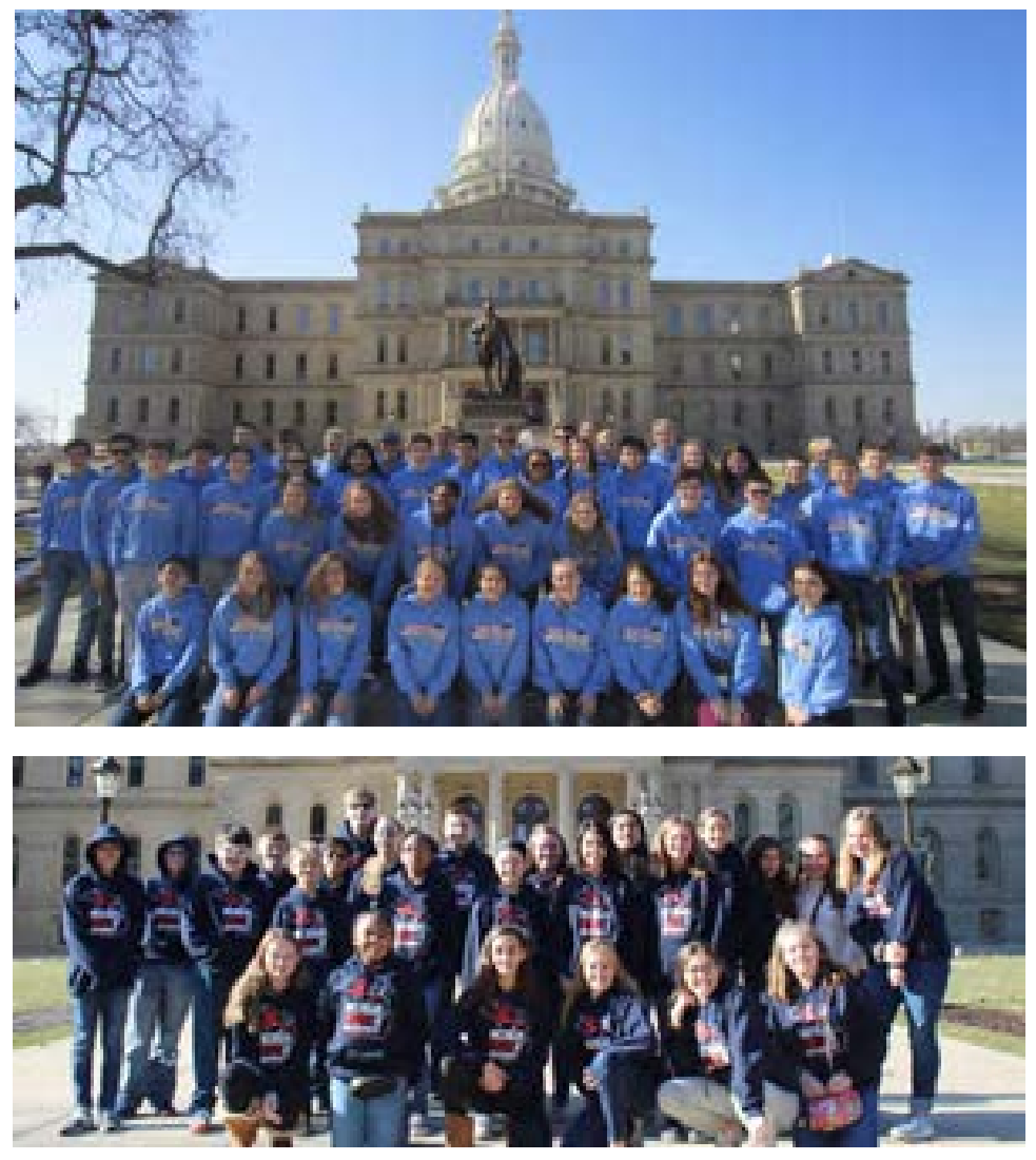
Here are the 2 photos, with the kids in black from White Pine Middle School, kids in light blue from Heritage.