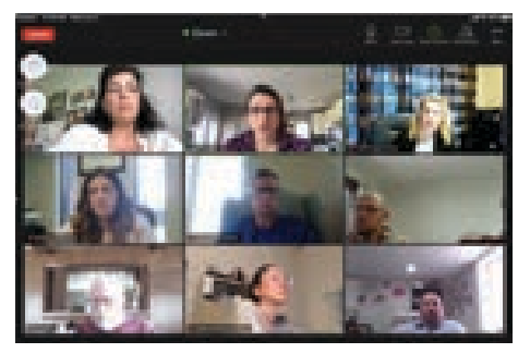
June SCBA Board Meeting by Zoom.

Your Officers and Board were hard at work during this lock down.