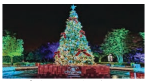
Warm wishes for a wonderful holiday season.

P.S. Something wonderful to do as a family <a href="https://www.facebook.com/groups/442354996404819/perma-link/652348652072118/">https://www.facebook.com/groups/442354996404819/perma-link/652348652072118/</a>