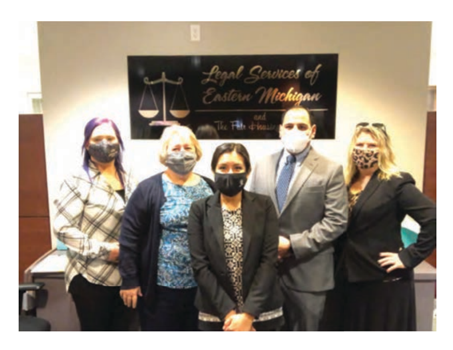
Have a safe and healthy over the holiday season!

Again, thank you all for your help and support. If you would like to join the Pro Bono Committee, please reach out to any of the members.